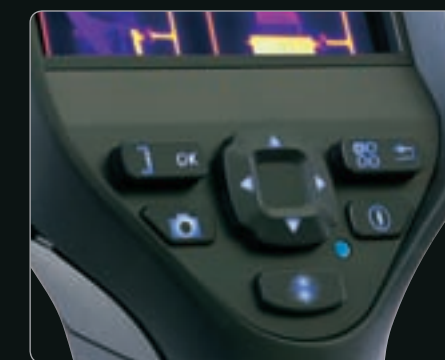
Large Backlit Buttons Fit Bare Hands or Gloves