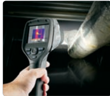
Spot LED Light for Dark Corners

Presenting the best performance and value in compact thermal imaging cameras ever, designed to fit beautifully into your IR inspection program, budget, and the palm of your hand.