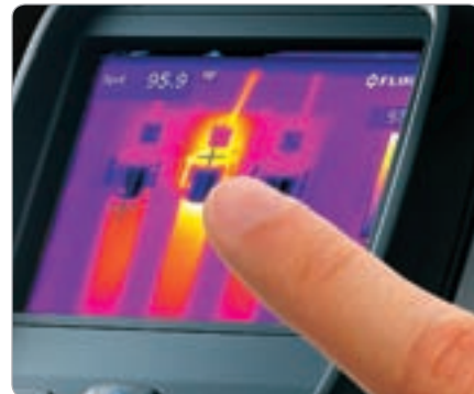
Add Up to 3 Moveable Measurement Spots Easily