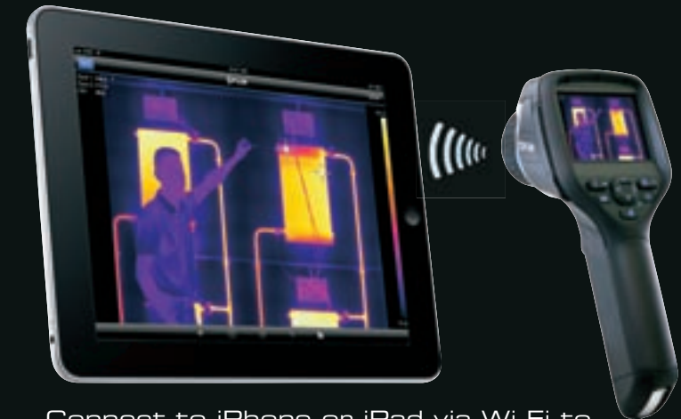
Connect to iPhone or iPad via Wi-Fi to Use the FLIR Viewer App for Processing and Sharing Results