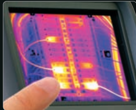
Large 3.5" Touchscreen Puts Fast Tools at Your Fingertips